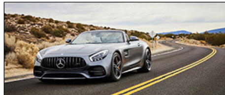
The 2018 Mercedes-AMG GT C Roadster Built to be wild.